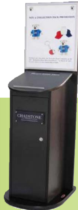
Competition Entry Box

Customised matching Brochure stand and entry box