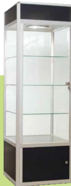
SD12 Tower Showcase 1 x LED Lights, lockable castors, 3 shelves 2000H x 600L x 600D