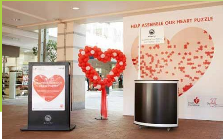
Warringah Mall Heart Foundation Promotion Poster Stands, Counter Unit, promotional balloons and signage