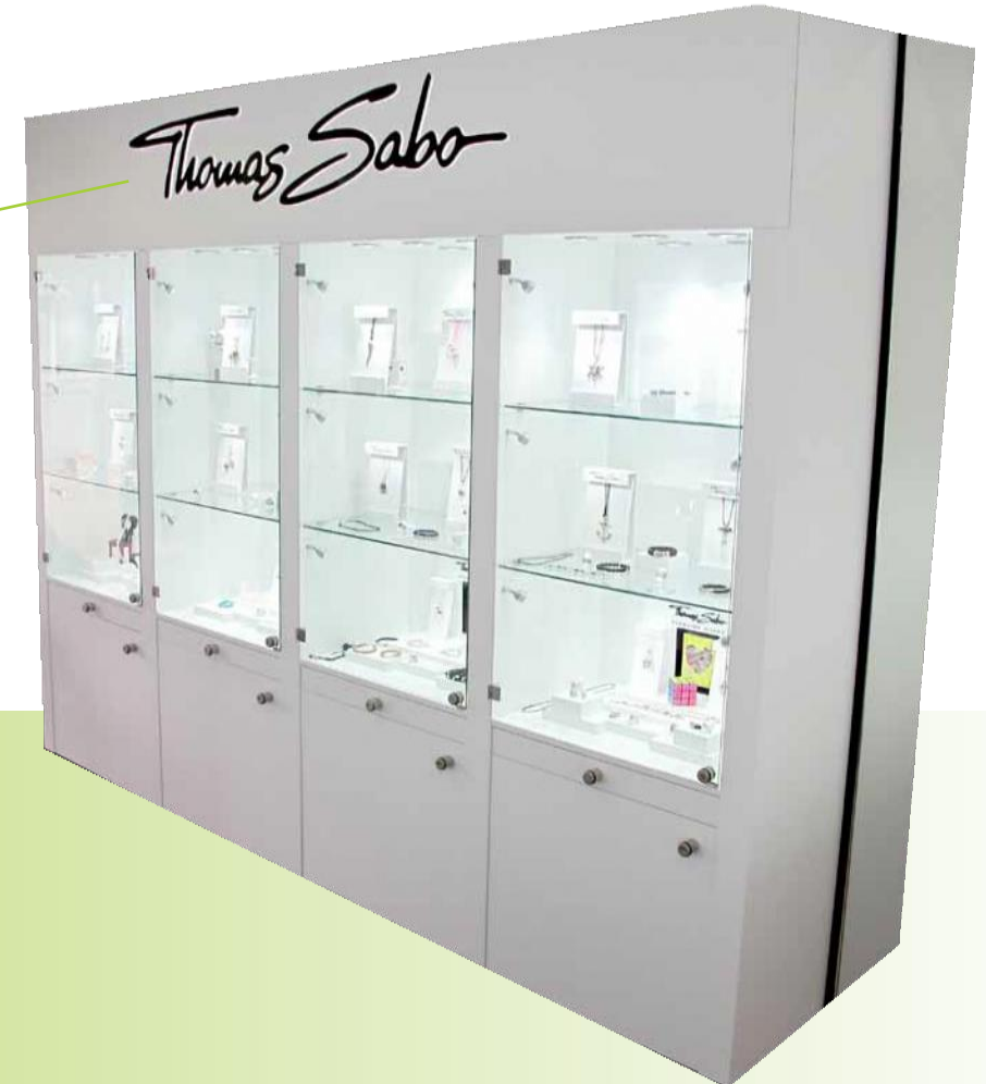
Thomas Sabo Jewellery Cabinets and shop fit outs.