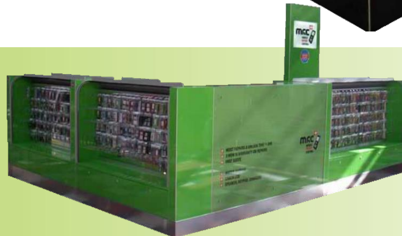
MCC Mobile Repair Central 2 Pac Finish