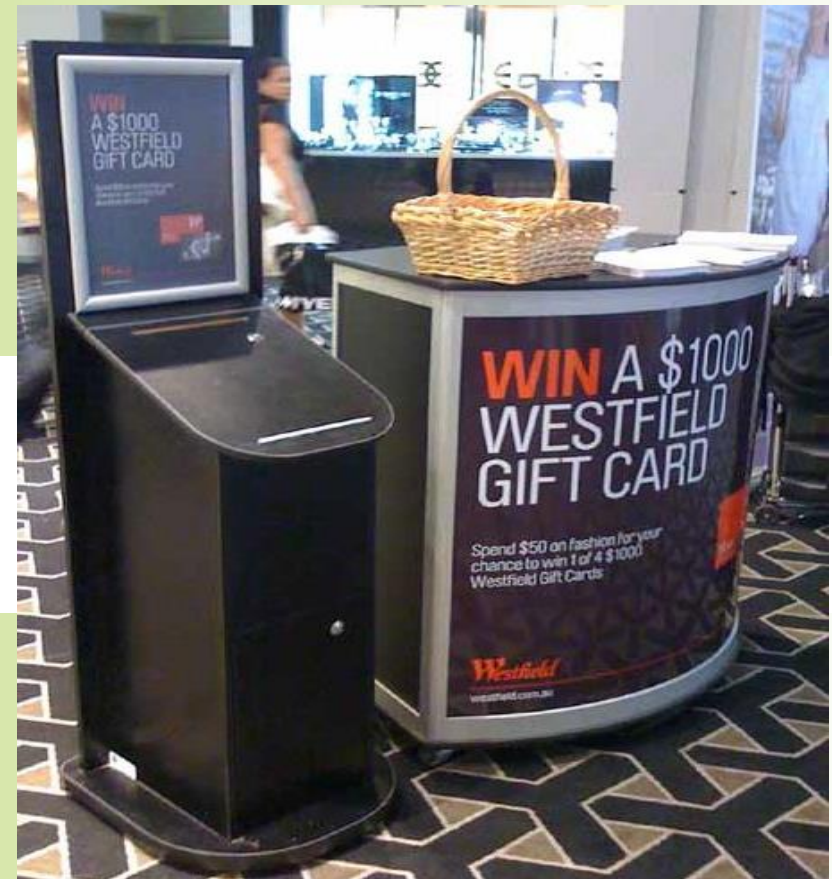
Chatswood Westfield Promotion Entry Box and Counter Unit