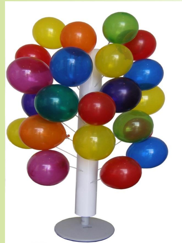
Balloon Tree Grey Powder Coated, Cast Iron Base

A wide range of accessories and mall furniture is available for purchase to assist with the presentation and promotion of products in your centre. Accessories can be custom matched to compliment your existing style and coordinated with other Shop the Mall products.