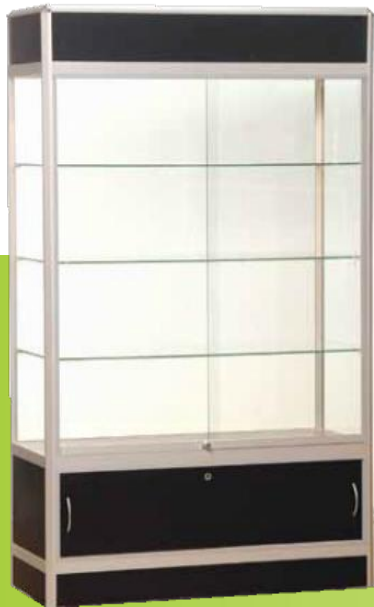
SD8 Window Showcase 2 x LED Lights, lockable castors, 3 shelves 2000H x 1200L x 600D