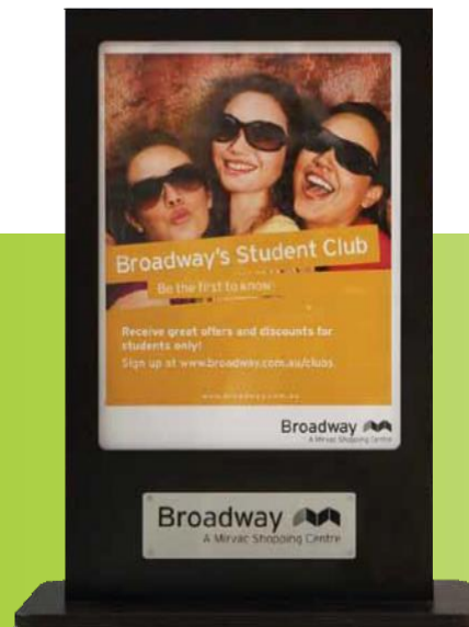
PS1 Straight Base Double-sided Black Poster Stand