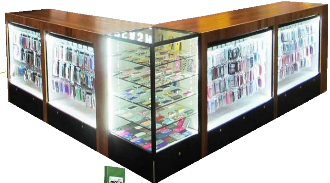
MRC Mobile Central Kiosk