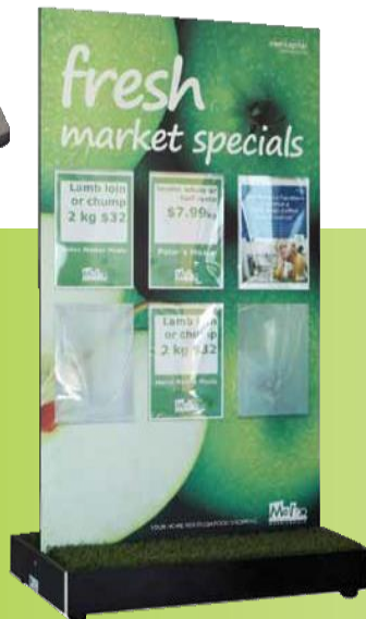
PB1 Promotional Board Great for positioning in high traffic areas of shopping centres. Optional size, finish, and extras such as brochure holders and lockable castors. Ideal for low budget promotions.