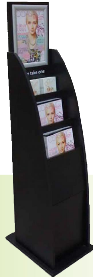
CBS Custom Brochure Stand Three-tiered Brochure Stand with A4 Snap frame and lockable cupboard