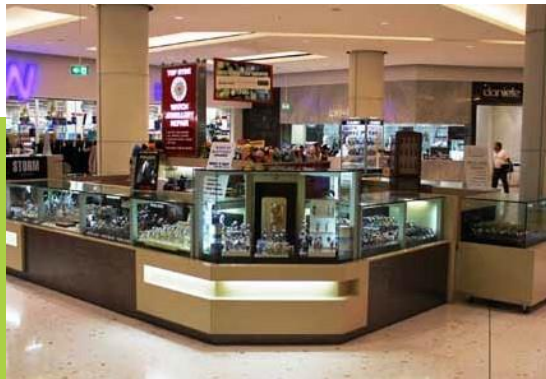
WJR Watch and Jewellery Repair Kiosk