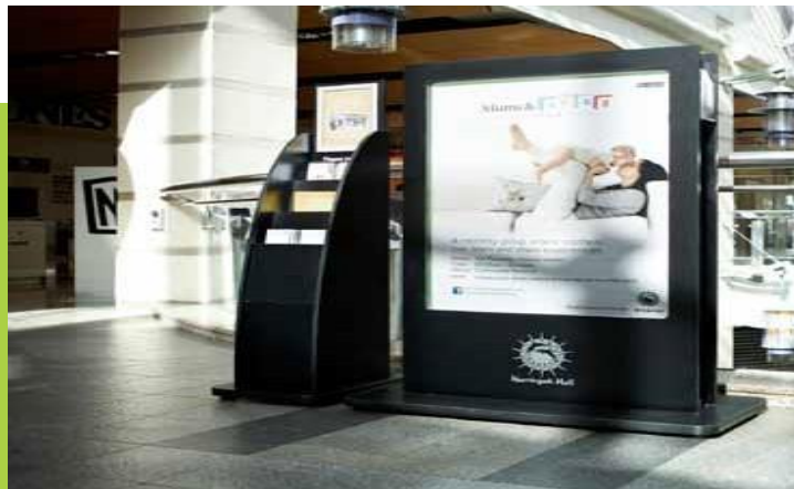
Warringah Mall Promotion Poster and Brochure Stand combination