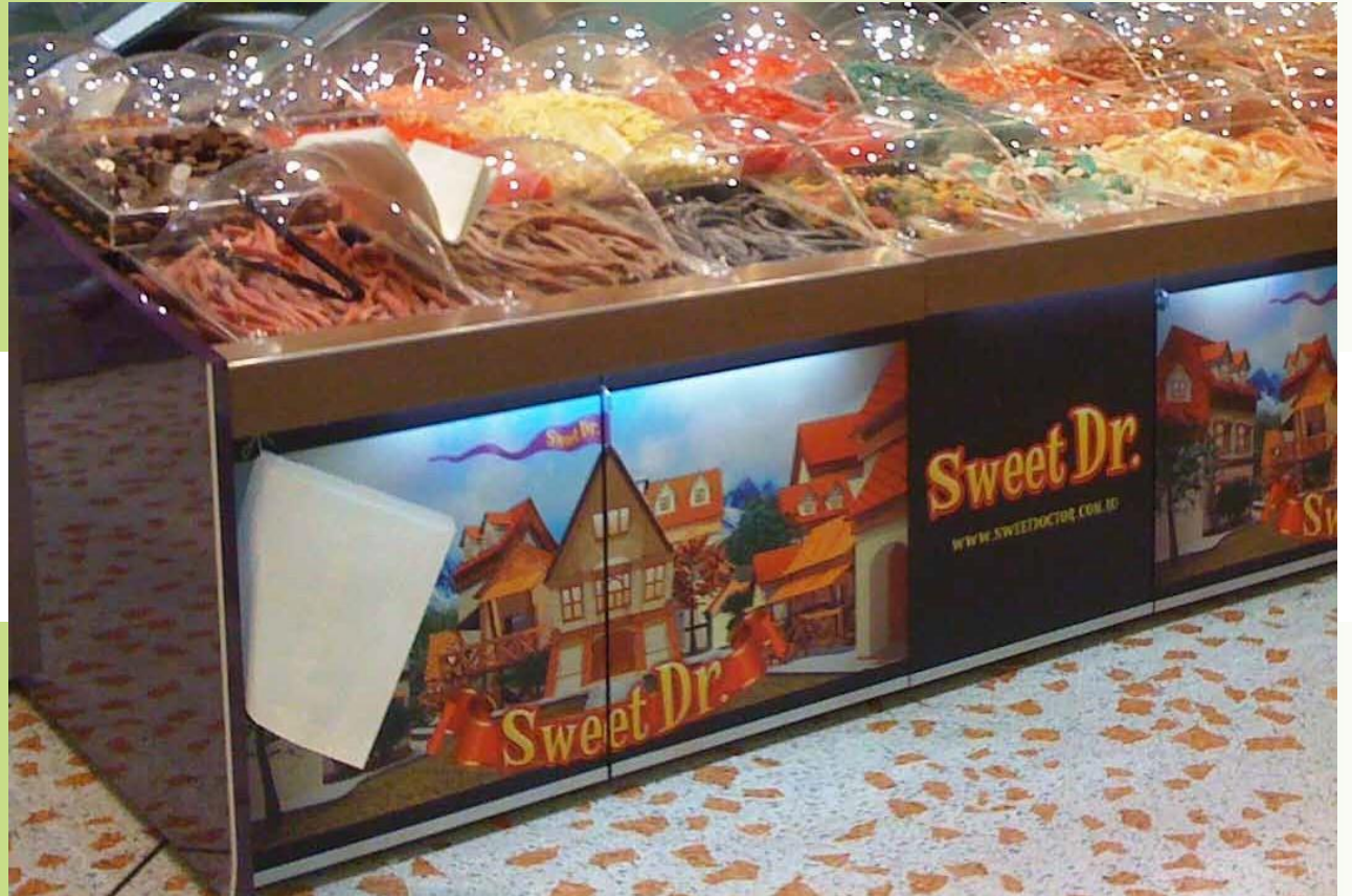
Sweet Doctor Custom Stand