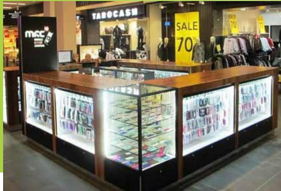
MRC Mobile Repair Central Solid Timber