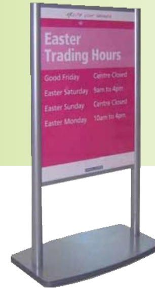
FSPU Free Standing Poster Unit Powder coated aluminium uprights 2 x acrylic covers Melamine base with T-mould edging