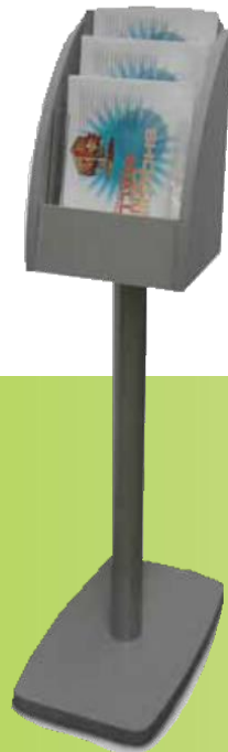
FSBS Free Standing Brochure Stand Perfect for single flyers and pamphlets Powder coated aluminium upright

Optional snap frames can be attached to the top of brochure stands, A4, A3 or custom made to suit your brochure or flyer size.