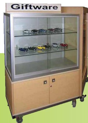
MP1S with Showcase Lockable cupboard base with glass display cabinet.