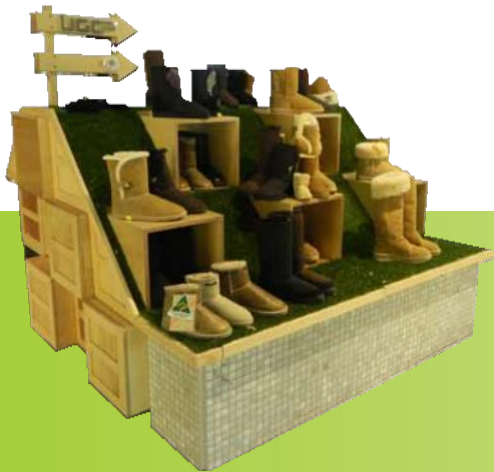
Uggnat Custom Design Display Sydney City Westfield

We custom design and build your kiosk to suit your product and brands specific needs. We take into consideration the layout and style of the Shopping Centre. We can create simple promotional displays through to complex and innovative kiosks for both short- and long-term leases.