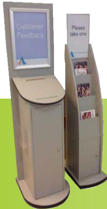
Competition Entry Box and Brochure Stand

Designed for competition entry and customer feedback forms, the Entry Box features a sloping top while the lockable cupboard collects the forms. The unit can be fitted with a 15 x 20 inch or A4 snap frame for promotional material.