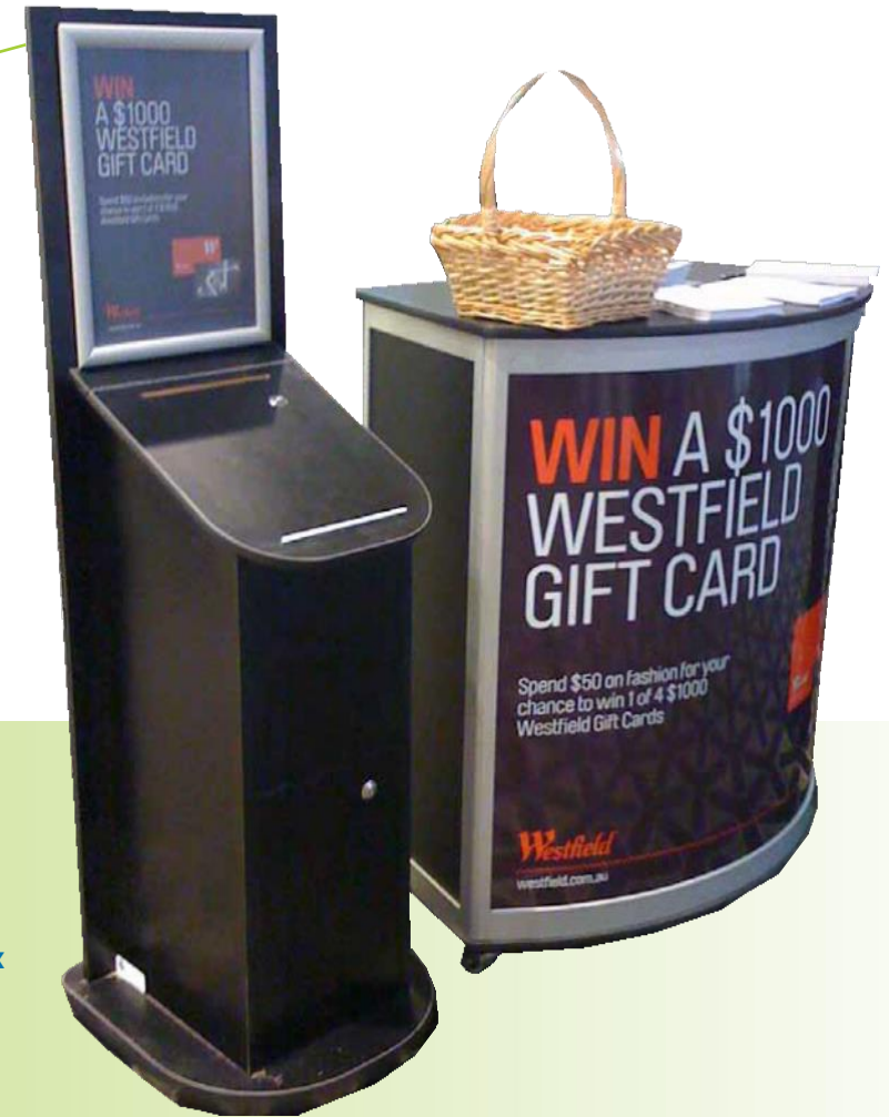
Entry Box & MPCU2 Counter Westfield Promotion