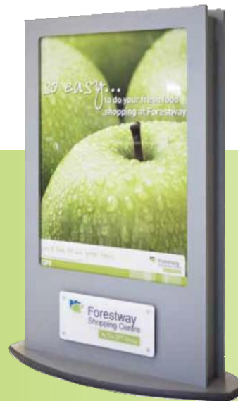
PS1 Curved Base Double-sided Silver Poster Stand