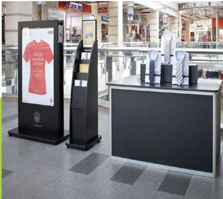
Warringah Mall Display Poster Stand, Brochure Stand and Mall Merchandising Table

Small Entry Barrel, branded Counter Unit, and promotional poster