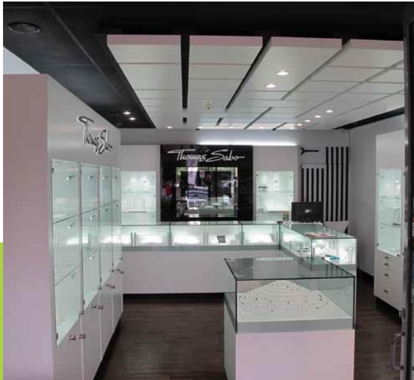
Thomas Sabo Jewellery Cabinets and shop fit outs.

Shop The Mall design and build high quality joinery and display units. Jewellery cabinets are an area we specialise in featuring frameless glass using the latest gluing technology, LED lighting, high quality hardware and a range of finishes. We can work with you to design anything from a single cabinet to a complete kiosk or complete shop fitout.