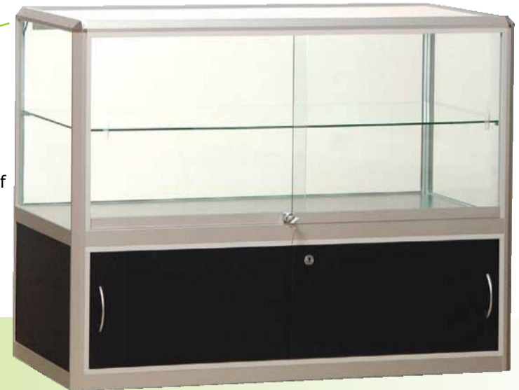
SD2 Counter Showcase LED lighting, lockable castors, 1 shelf 950H x 1200L x 600D