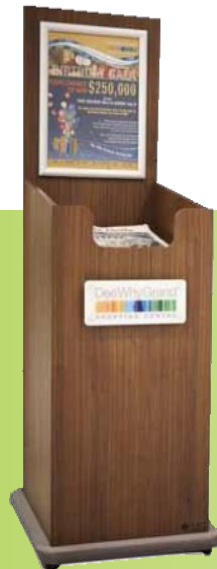
NS1 Newspaper Stand

Custom sizing to fit catalogues Snap Frame at top holds image of front cover Optional storage cupboard & push to open or lockable door at base