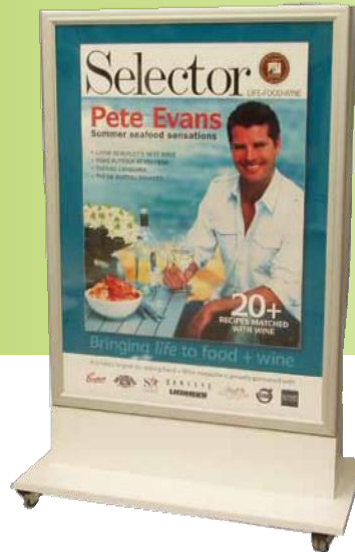
PS5 Poster Stand 2 x Snap Frames 30"x40" Posters