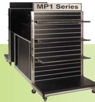
MP1 and MMT4 Combined Unit Combine several units together to create a multi-function merchandising display.

MP1C with Cupboards Optional lockable base cupboard measures 400mmH 1350H x 500D x 1000L