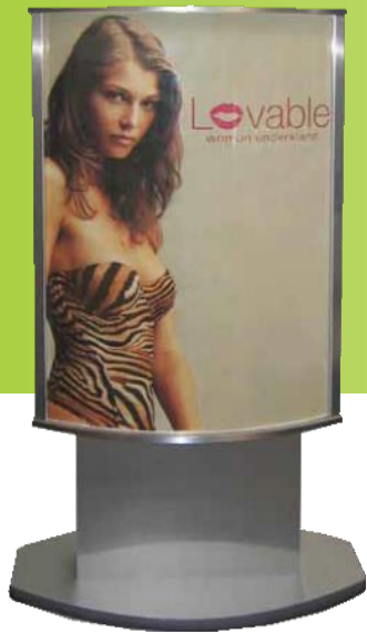
PS3 Poster Stand Brushed Aluminium, Double-sided Poster Stand with Elliptical shaped Top & Base