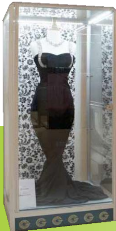
SC20 Mannequin Showcase 2000H x 740L x 740D

Many showcases are available, if you don't see what you need in the catalogue let us know and we can work with you to determine a design or provide you with some suitable options.