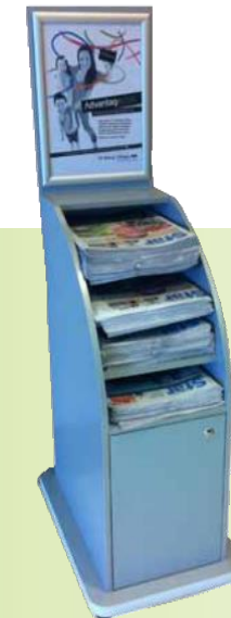
NS2 Newspaper Stand – Tiered

Single shelf newspaper stands with snap frame for advertising