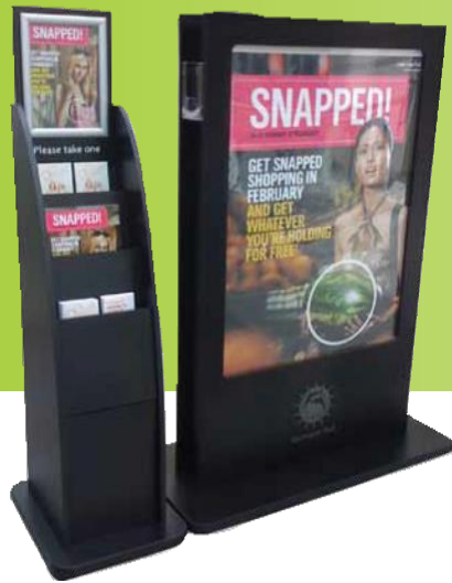
Custom Brochure Stand and 30" x 40" PS1 Poster stand