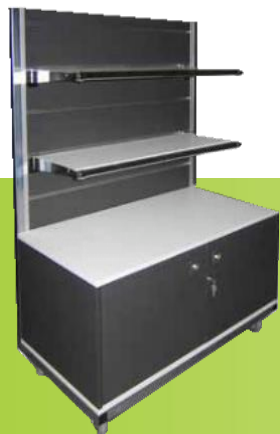
MP1C with Cupboards Optional lockable base cupboard measures 400mm H.