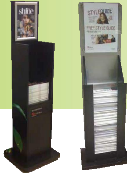
MS1 & MS2 Magazine/Catalogue Stand

Custom sizing to fit catalogues Snap Frame at top holds image of front cover Optional storage cupboard & push to open or lockable door at base