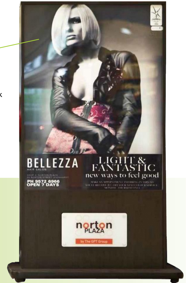
PS2 Poster Stand Double-sided Black Poster Stand